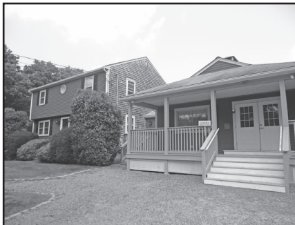
East Sandwich $449,900

1500 SF high visibility art school/studio or childcare w/ 4 bedroom attached residence.