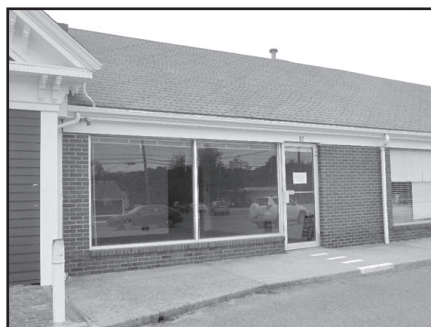
West Dennis $119,900

Condo unit in strip mall next to W. Dennis PO, 1140 sqft retail/office, 2 large rooms, office, bath.