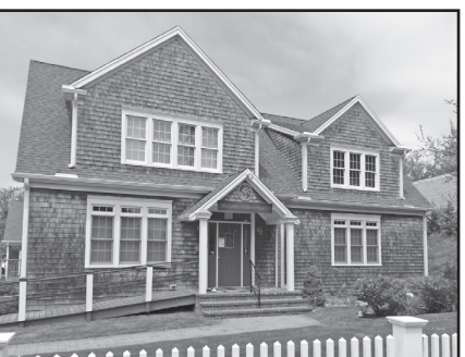
Orleans $1,568 NNN

For Lease: 1 st fl 1568 sq ft Class A office/retail, ADA, great visibility, in-town location.