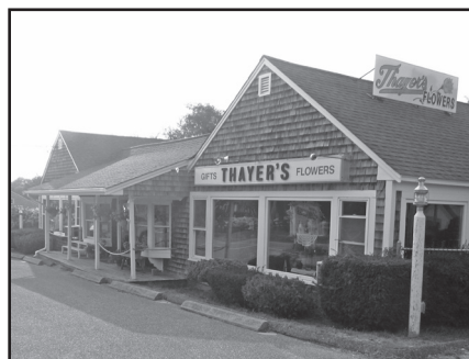
South Harwich $89,000

Florist business for sale w/lease of shop or lease/purchase option. Many options - call for details.