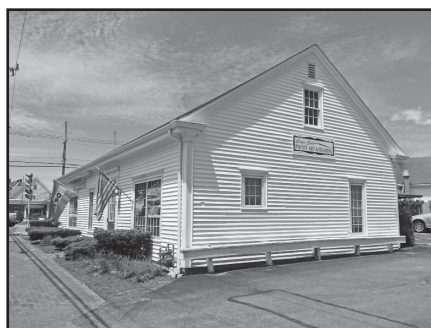
Orleans $5,417 NNN

For Lease: Center of town, walk-by traffic, highest visibility. 3320 sqft & 2120 sq ft basement.