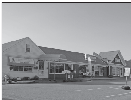
West Dennis $239,900

Great visibility next to Post Office: 2400 sqft retail/office condo. Owner may help finance.