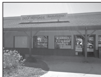
East Falmouth $14.50/sf

For Lease | $14.5/SF/Year | 2,350 SF Last unit available in very busy retail plaza.