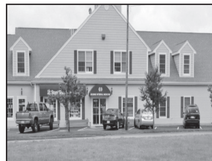
Bourne $ call

Lease 2,256 sq ft available with Drive-thru, 1/2 mile from Bourne Rotary, 1.89 acres.