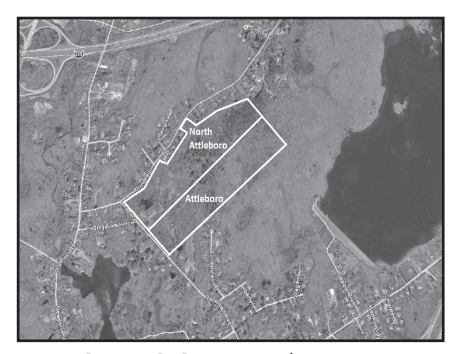
North Attleboro $3,000,000

Price reduced. Land development opportunity. Frontage on Rocklawn & Mt Hope 92+ acres.