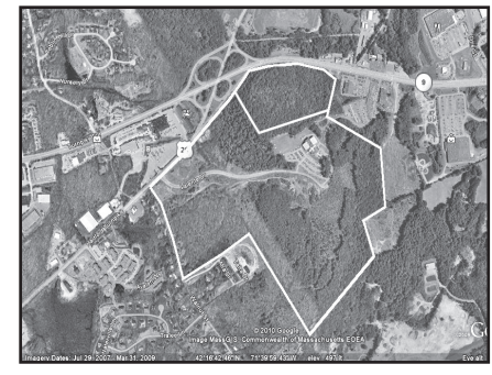
Rte 9 & 20