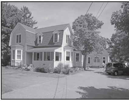
Harwich Port $799,000

Mixed use, 1940 sq ft retail, 2717 sq ft residential in commercial zone. Creative financing offered.