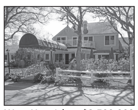
West Harwich $3,500,000

Inn - 27 units with 46 seat restaurant, pool. Steps from Nantucket Sound